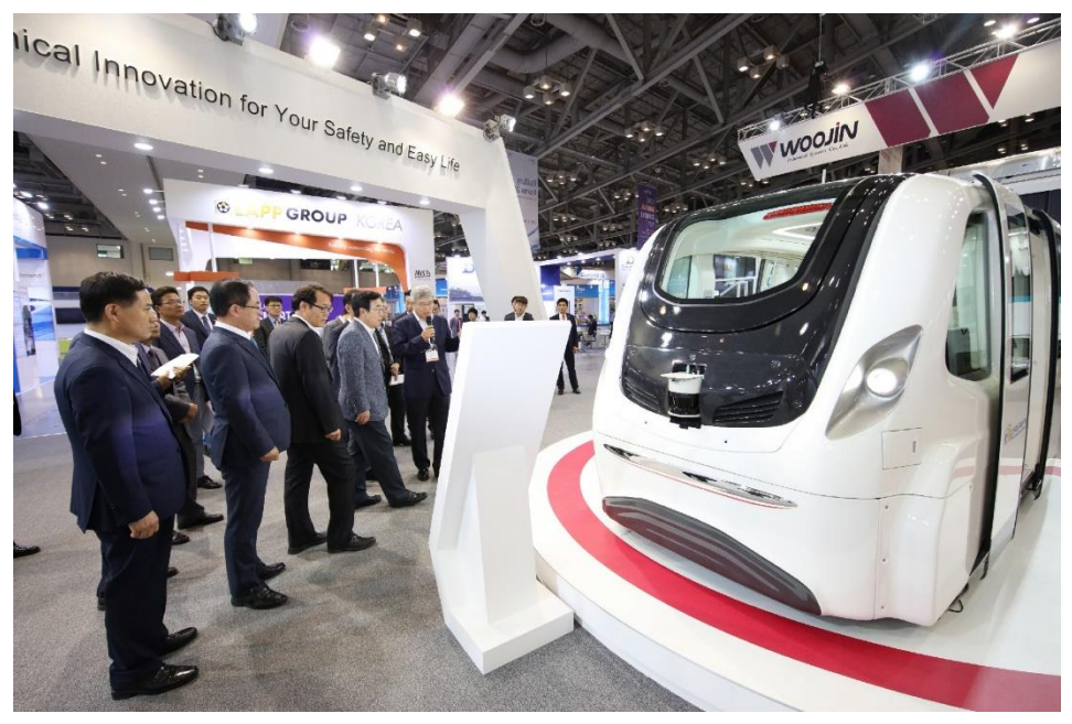
Train vehicle models were exhibited at RailLog Korea 2017

The previous edition of the fair, which was held in June 2017, attracted 18,470 visitors and 163 exhibitors from 22 countries and regions. Numerous global players participated in the fair, while Korea's leading companies, such as Hyundai Rotem and Woojin Industrial System, exhibited their latest models of train vehicles at the fairground.